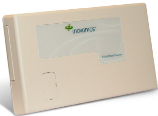
EN4200: Refer to Panel Partners for product details.

Serial receivers use a predefined and matched serial data stream as input to Intrusion, Access or VMS's.