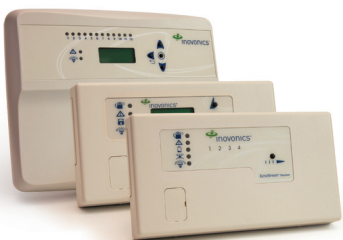
EN4232MR, EN4216MR, EN4204R

Add-on receivers use hardwired form C relays as inputs to Intrusion, Access or VMS's.